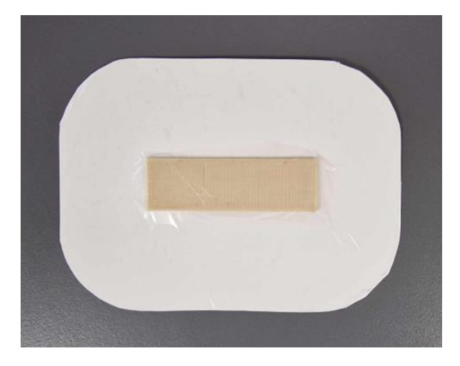
Fig. 1. Printed patch with Adhesive Bandage.