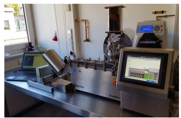
Fig. 1. Set-up for the benchtop twin-screw granulation

corn starch, 5% PVP 30 and 0.2% talcum has been granulated using water. The process parameters total throughput, liquid-to-solid ratio (L/S), screw speed and barrel temperature as well as the screw configuration have been varied independently in this study.